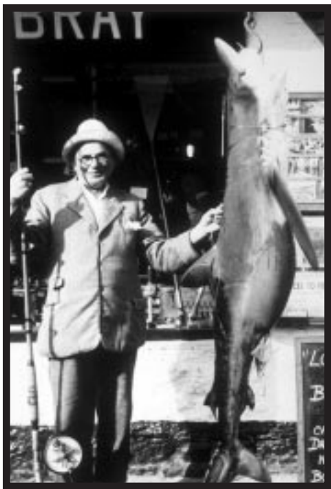
Hulton Deutch Collection